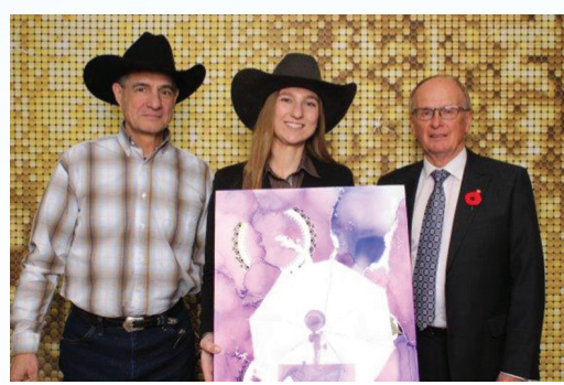
BUSINESS OF THE YEAR AWARD Austin's Saddlery